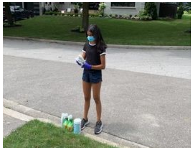
Curb-side pick-up for the Mississauga-Lakeshore Constituency Youth Council's annual toiletries drive to continue to support the Compass Food Bank.

Through the Rapid Housing Initiative, a $32.75 million investment was made for the construction of ~77 affordable homes in the Region of Peel. This includes $2.3 million for the Armagh Housing Expansion project, which will provide 10 new transitional housing units for women and their children fleeing domestic violence in our community.